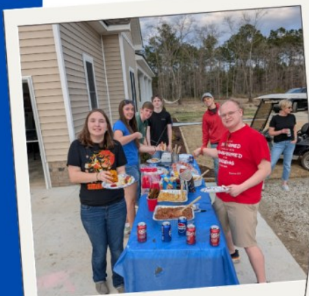
Bonfire and Smares