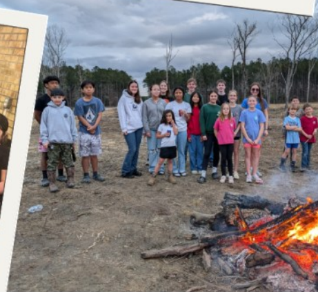
Bonfire and Smares