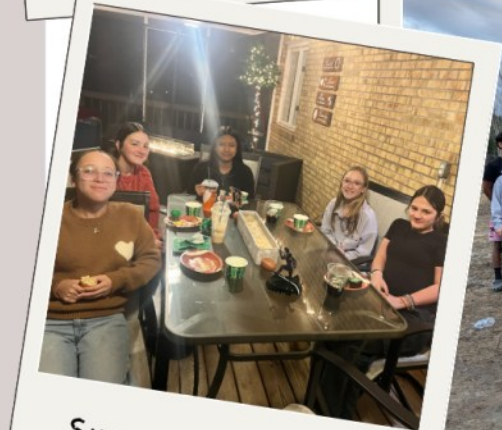
Super Bowl Party