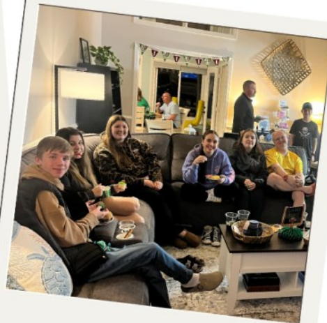
Super Bowl Party