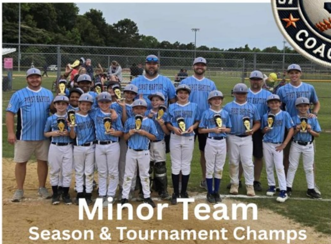
Minor Team Season & Tournament Champs