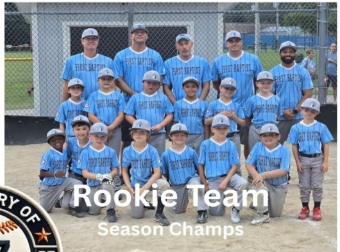
Rookie Team Season Champs